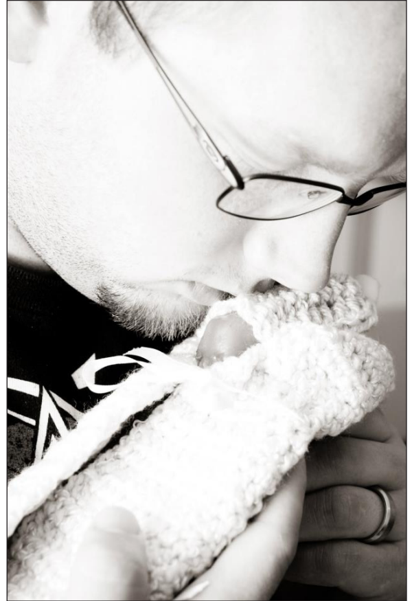
Now I Lay Me Down To Sleep Organization

In the future, I plan on supporting the Now I Lay Me Down To Sleep organization with baby clothing items and monetary donations as well. If you have had service from them, or just feel moved by this story I really recommend donating to this charity. I know there are so many different charities to donate money too, but this is one that really can make a horrible, heart-wrenching experience become somewhat emotionally manageable. 8